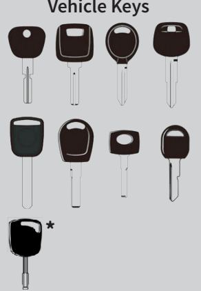
* Requires optional M3 Jaw (not included).