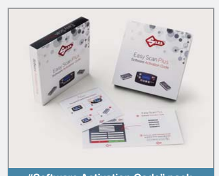
"Software Activation Code" pack

To activate the software follow the instructions supplied in the Software Activation pack.